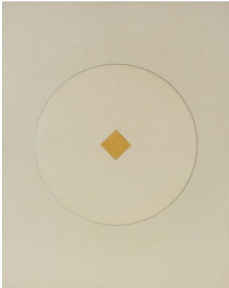
Arrival, 2014, mixed media, 40 x 32 in.